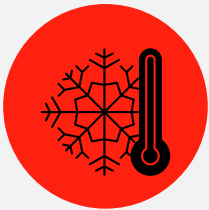
Industrial Water Chiller