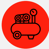
Air Compressor Unit and Parts