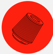
Consumables, Filters and Separator