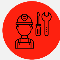
Preventive and Corrective Maintenance