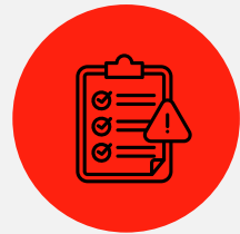
FREE Checkup and Inspection